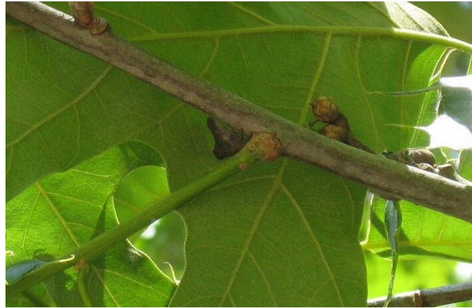
adult on Quercus