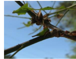
nymphs on Quercus