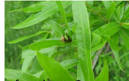
female on Quercus