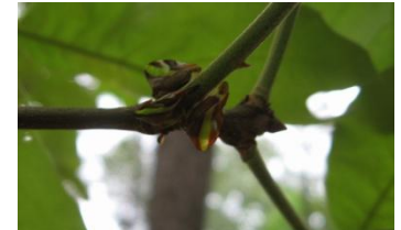
females on Quercus