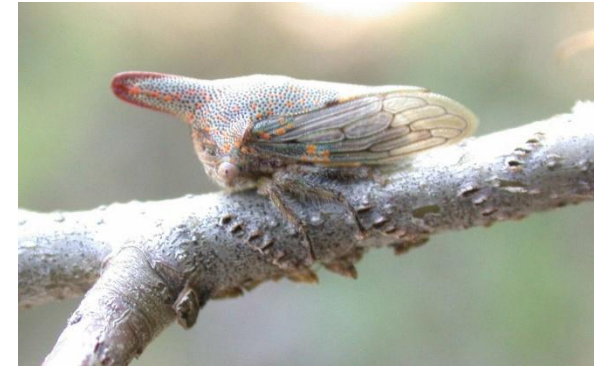
female & oviposition slits