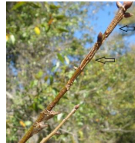
adults & eggs