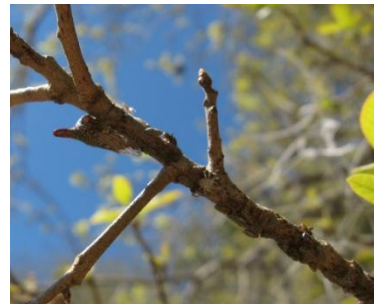
females with nymphs