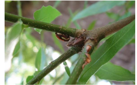
female on Quercus laurifolia