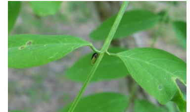
on Campsis radicans