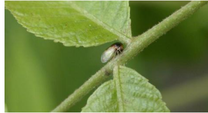
on Juglans nigra