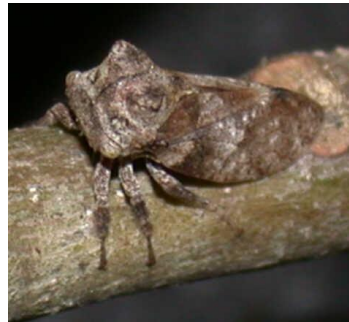
male on Quercus