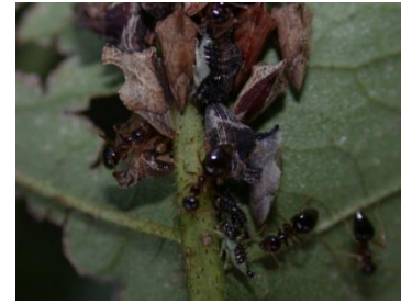
adults & nymphs tended by ants