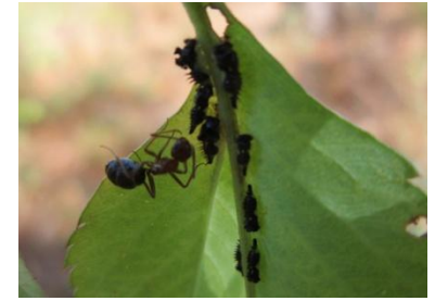
nymphs on Bidens tended by ant