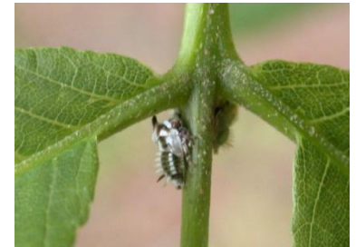
nymph on Juglans nigra