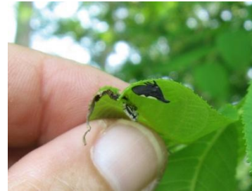
adult & shed skin on Juglans nigra