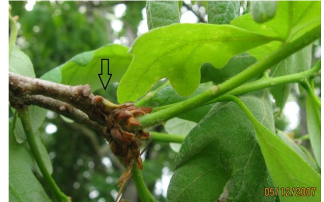
nymph on Quercus alba