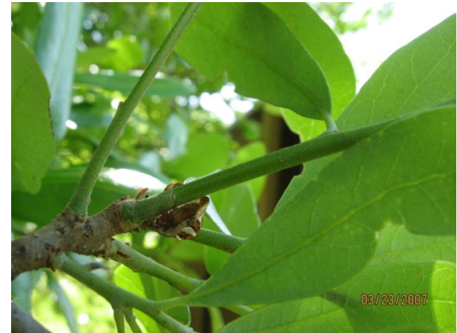
adult on Quercus virginiana