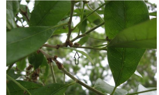
female on Quercus virginiana