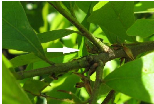
female on Quercus nigra